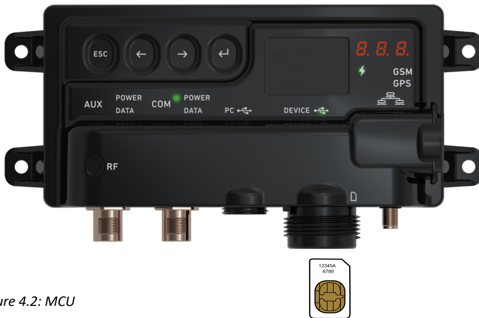
Figure 4.2: MCU

The bus connector is an NMEA 2000 compatible male Micro-C 5 pin connector. It is not recommended to connect a T-connector directly on to the unit, a drop cable should be between the main bus and the unit. The USB B mini connector is only designed to fit with an original MCU cable. The MCU-200 and MCU-250 are equipped with a female SMA connector for GSM antenna connection and a SIM card receptor that accepts mini-SIM. The SIM card is mounted behind the yellow cap. See figure 4.2.